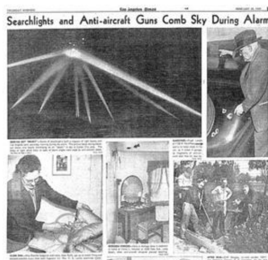
The truth is out there

http://blogs.houstonpress.com/hairballs/2012/02/ufo-s aliens battle la.php